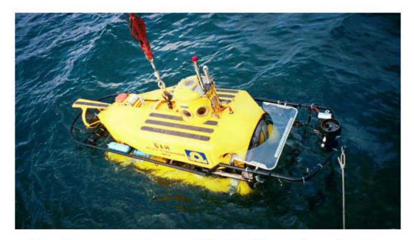
The 3-person submersible PC-8B , equipped with a scanning sonar, lights, an underwater video camera, and manipulator, is capable of diving to depths of 250 meters.