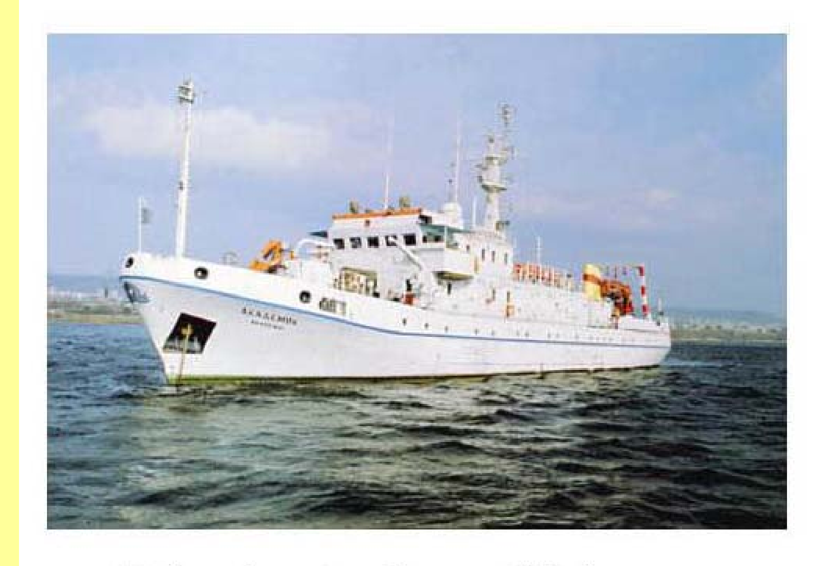
Bulgarian Academy of Sciences Research Vessel Akademik